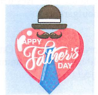
Happy Fathers' Day June 16

Bulk pick-up will be the week of June 24th on your regular garbage pick-up day.